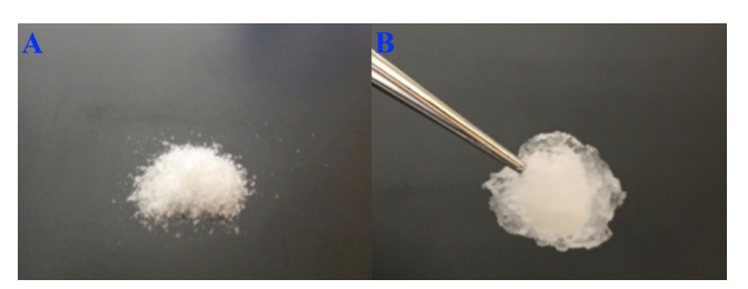
FIGURE 2. Polymerized methacrylate powder forms. (A) Methacrylate polmer powder. (B) Aggregation following application of ionic saline medium.

This document contains proprietary information, images and marks of Journal of Drugs in Dermatology (JDD). No reproduction or use of any portion of the contents of these materials may be made without the express written consent of JDD. If you feel you have obtained this copy illegally, please contact JDD immediately at support@jddonline.com